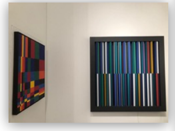
Art Miami '2018