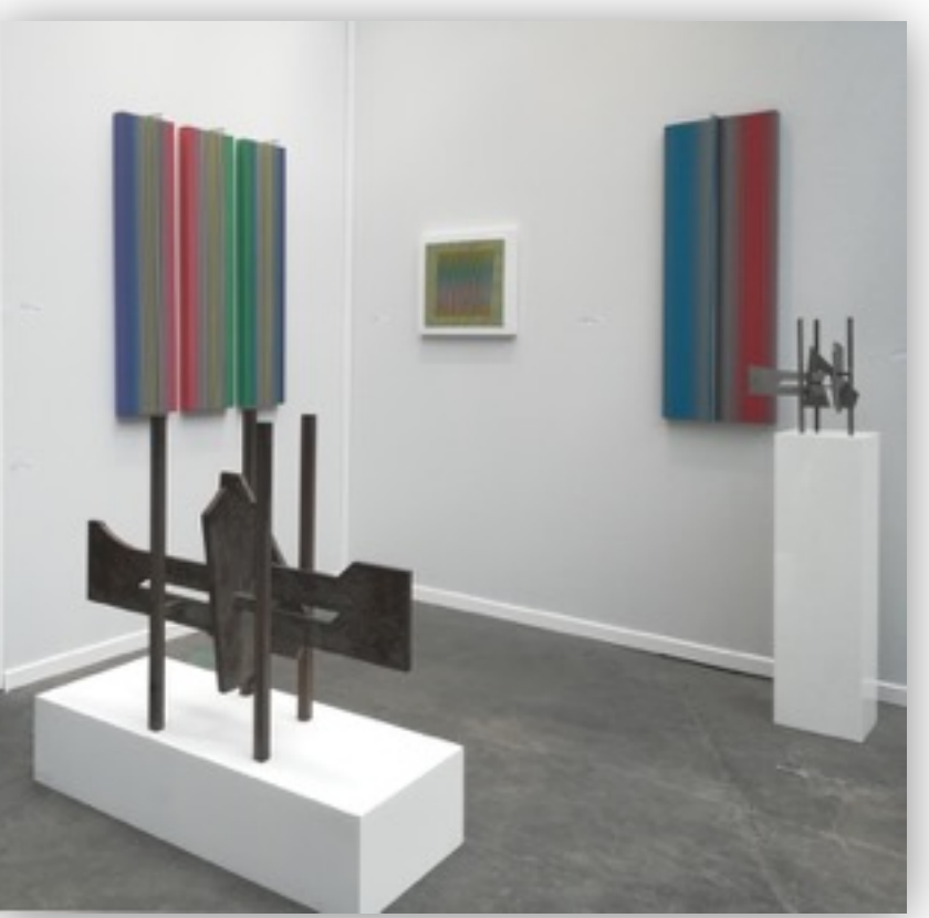
Art Paris '2019